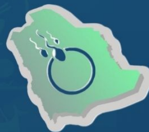
المجموعة السعودية لعلم الأجنة Saudi Arabian Group for Embryology (SAGE)