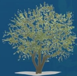
The Jordanian Society for Fertility and Genetics